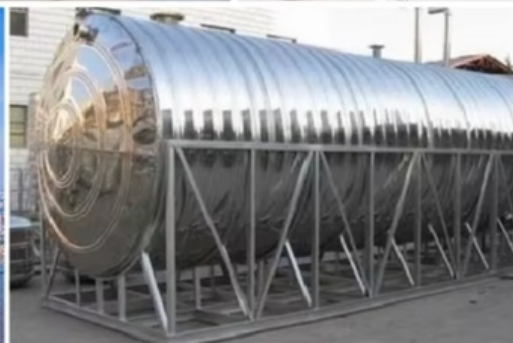
Packaging & Delivery